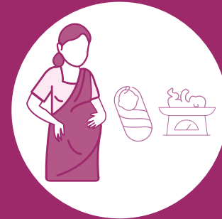
Maternal and Newborn Health