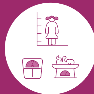
Nutrition among adolescents and pregnant women