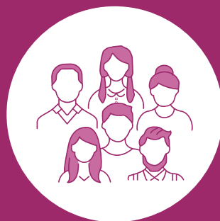
Sexual and reproductive health of Key Populations (KPs)